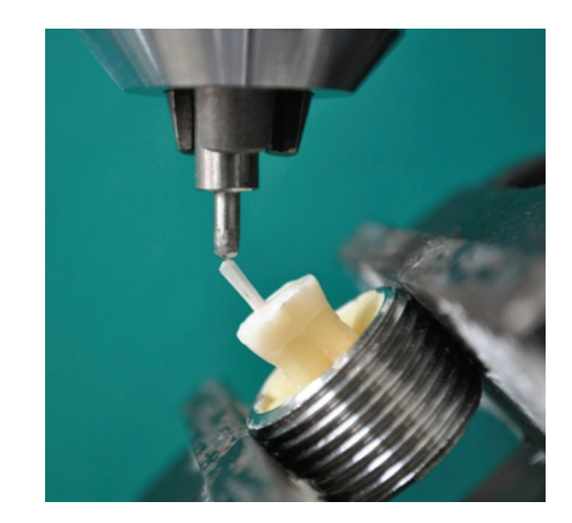
FIGURE 3: Example of a sample mounted on the loading machine and prepared for the fracture test. The tooth is oriented such as the load applied by means of the metallic stylus would have a 45-degree direction.

About post insertion depth, it is known that with cast post and core system the post length was an important variable, because reducing post space can permit to save tooth structure positively affecting the tooth fracture resistance. Some authors [45] in a recent study designed to obtain a biofaithful model of the maxillary incisor system and to assess the effect of glass fiber post lengths using Finite Element Analysis showed that the overall system's