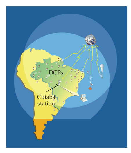
Figure 1: Brazilian Environmental data collection system and Cuiabá and Alcântara station visibility circles.

(realtime) sent down to the reception station. The platforms installed on ground (fixed or mobile) are configured for transmission intervals of between 40 to 220 seconds. In a typical condition, in which both transmitter and receiver are close enough, this period can last up to 10 minutes. The DCP messages retransmited by the satellites and received by the Cuiabá and Alcântara stations are sent to the Data Collection Mission Center located at Cachoeira Paulista, for processing, storage, and dissemination to the users, as seen in Figure 1.