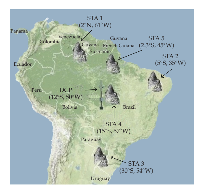
Figure 3: Reception stations configuring ideal geometry.