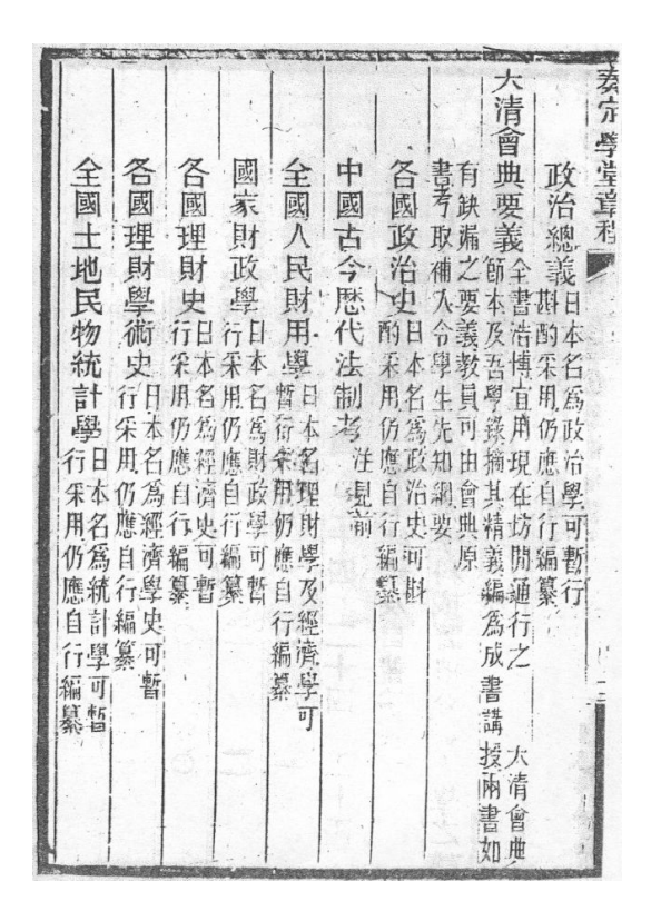
Figure 1: Zhang Zhidong et al., Memorial to fix the rules and regulations for New Schools (1904)